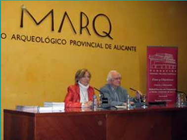
30-31.1.2009, Alicante Johan Galtung at the ITER Seminar